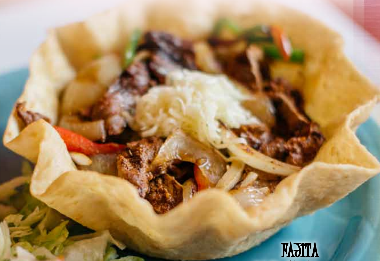
FAJITA TACO SALAD

Plump shrimp, crisp vegetables, and grated cheese on a bed of lettuce.