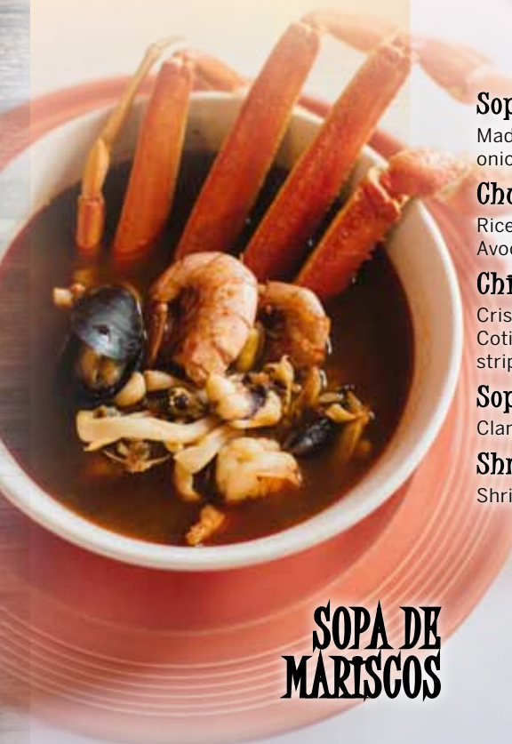
SOPA DE MARISCOS